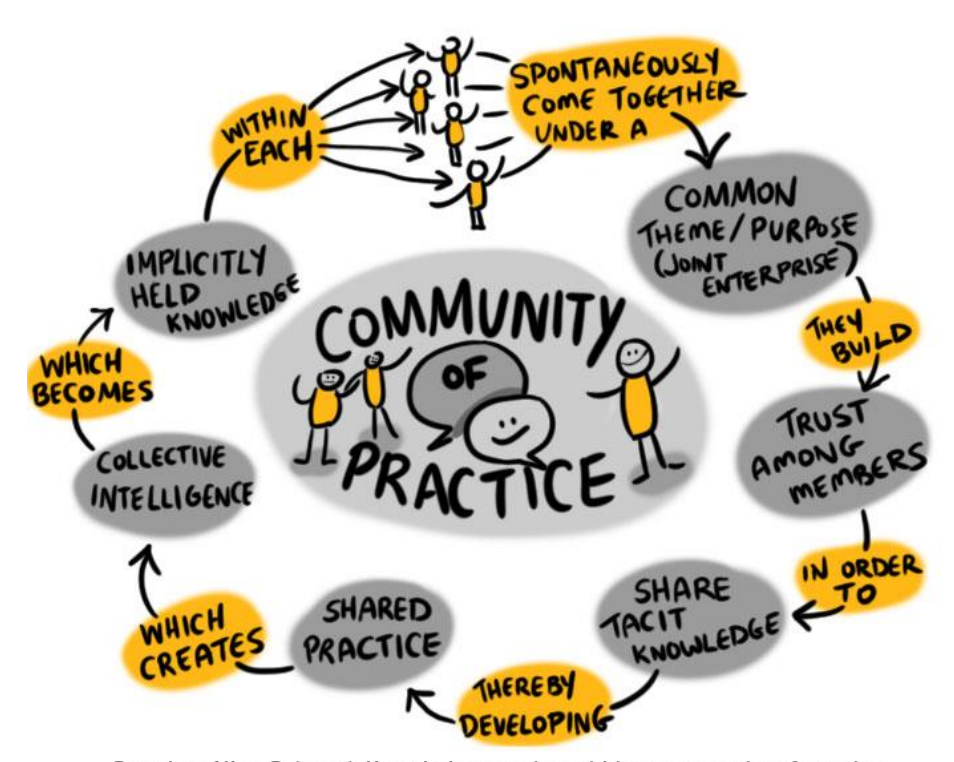
Based on Allan, B. (2008). Knowledge creation within a community of practice

The aim is to broaden your network to include diverse, cross-disciplinary skills and insights, and the online world affords just that. You will find that you can often meet peers and potential collaborators through chance online meetings in discussion groups or by using social networking tools such as Twitter.