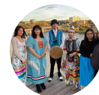
Young Indigenous Women's Utopia Organization Saskatoon, SK