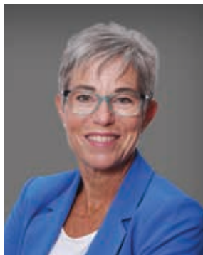
Selina Robinson Minister of Post-Secondary Education and Future Skills

A handwritten signature in black ink, appearing to be 'DE' followed by a stylized flourish.