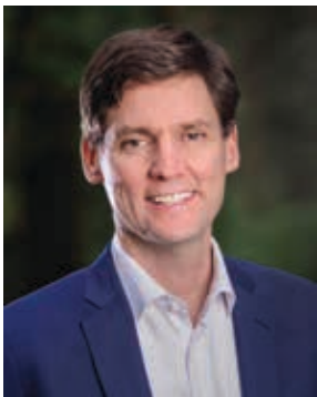
David Eby Premier

The actions in StrongerBC: Future Ready Action Plan open up opportunity, so people can build a good life for themselves and thrive, and we can build a brighter future and a StrongerBC, together.