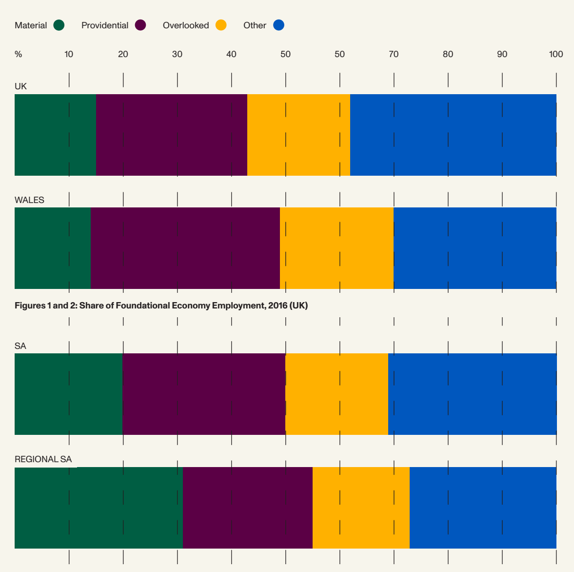
Figures 3 and 4: Material, Overlooked, and Providential Economy South Australia, 2016

though wages earned through the foundational economy are important, the value is also in the services that they provide, which are key to well-being. ^{12}