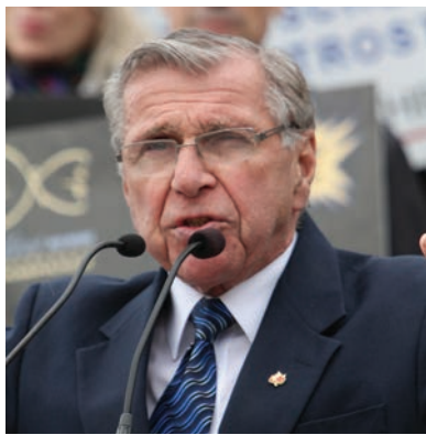
Guy Lauzon, Stormont-Dundas-South Glengarry