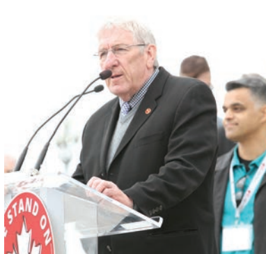
Senator Norman Doyle, Newfoundland & Labrador