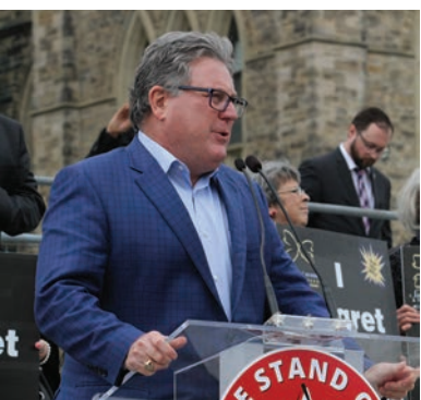
MP Phil McColeman, Brantford - Brant