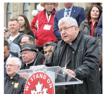
Archbishop of Toronto, Thomas Cardinal Collins