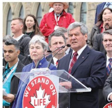
Supreme Knight of Columbus, The Honourable Graydon A. Nicholas