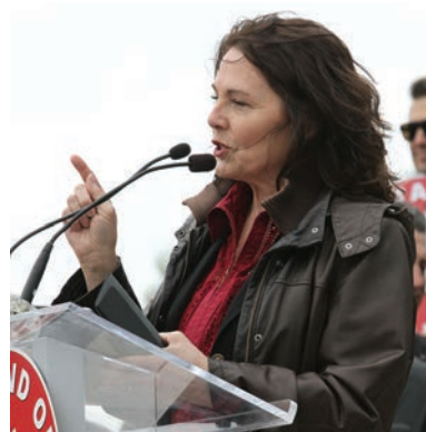
MP Cathay Wagantall, Yorkton- Melville