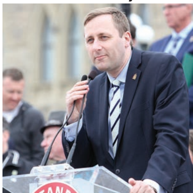
MP and CPC leadership candidate Brad Trost, Saskatoon-University