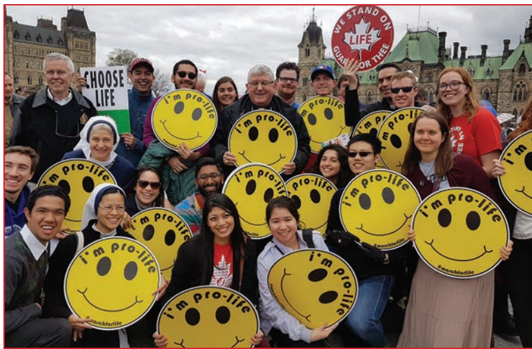
Above: Can you spot His Eminence Thomas Cardinal Collins?