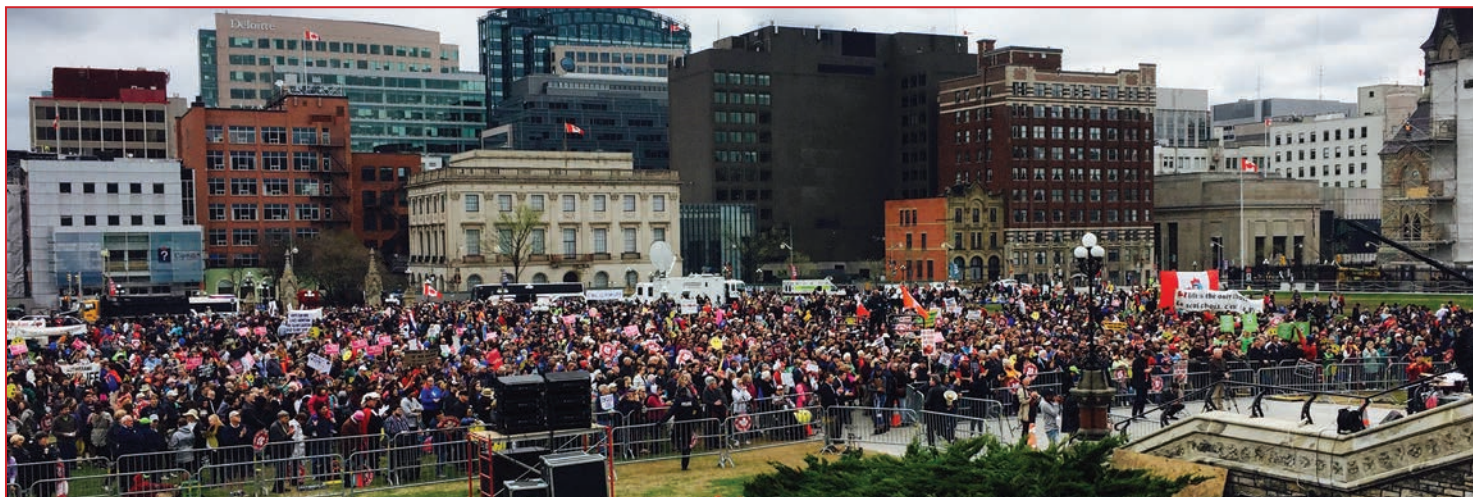
View from the Hill during the National March for Life Rally.

success by the 40 Days for Life program in the United States, Campaign Life Coalition brought it into Canada for the first time in 2007, holding our nation's first 40 day vigils in Ottawa and Halifax. Since then, CLC volunteers and other local pro-life groups have embraced the campaign, making it their own, and over the past few years, there have been 40 Days for Life campaigns in more than 20 cities across Canada. The workshop following the March for Life brought together representatives from Montreal (QC), Ottawa, Guelph, Toronto, Windsor, Mississauga, Oakville (ON), Winnipeg (MB), and Terrace (BC). The representatives were able to share stories and ideas, discuss goals and future plans, but most importantly, they were able to come together in fellowship and meet one another. If you would like to get involved in 40 Days for Life, the next campaign runs from September to November 2017. For more information go to 40daysforlife.com