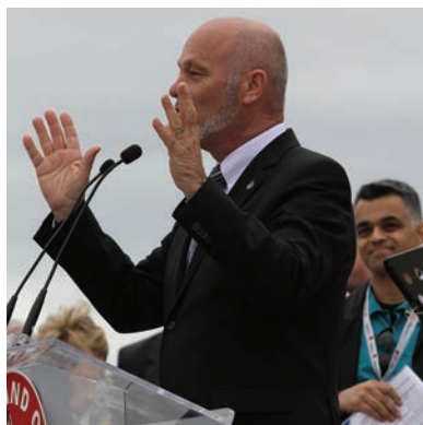
MP Dave Van Kesteren, Chatham-Kent Leamington