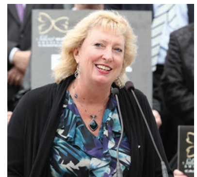
MP Marilyn Gladu, Sarnia- Lambton