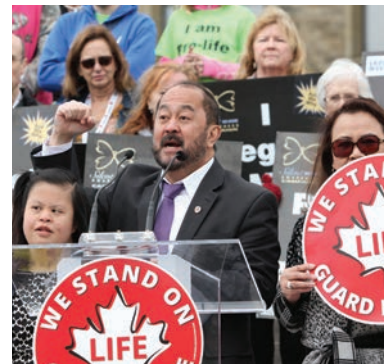
Senator Tobias Enverga with his family, Ontario