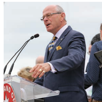
MP Bev Shipley, Lambton-Kent-Middlesex