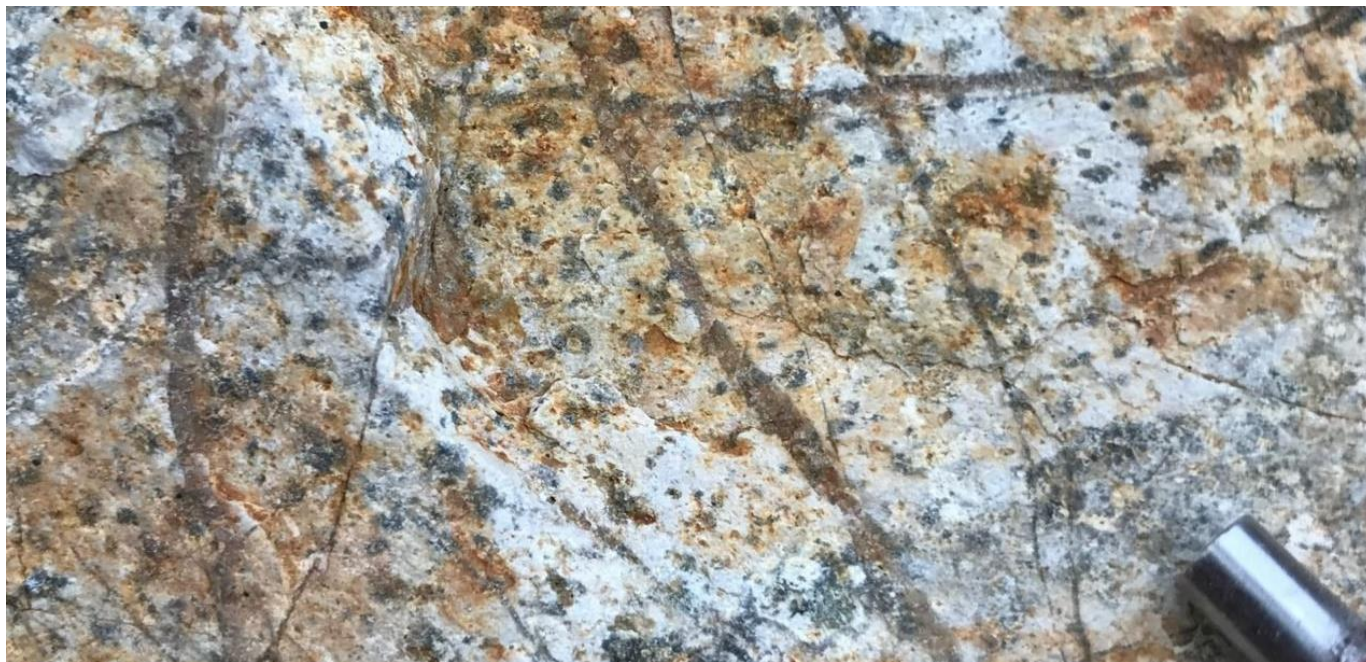
Figure 2. Translucent granular quartz veinlets associated with copper-gold mineralisation.

A copper-gold mineralisation event has also been identified as a separate and later mineralisation event, crosscutting the copper-molybdenum east-west trend. Future exploration and drill targeting will aim to follow this gold trend at depth.