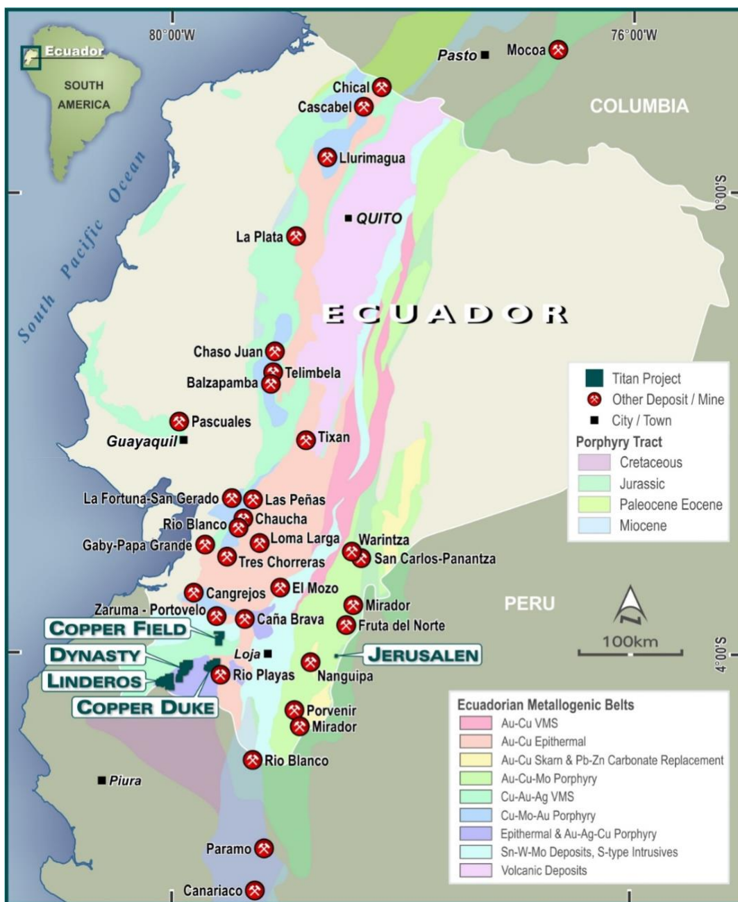
Figure 4: Linderos Project location map in relation to Titan Minerals Southern Ecuador Projects, and the metallogenic belts of Ecuador

Located in a major flexure of the Andean Terrane, the Linderos Project is situated within a corridor of mineralisation extending from Peru through northern Ecuador that is associated with early to late Miocene aged intrusions. The majority of porphyry copper and epithermal gold deposits in southern Ecuador are associated with magmatism in this age range, with a number of these younger intrusions located along the margin of the extensive Cretaceous aged Tanguila Batholith forming a favourable structural and metallogenic corridor for intrusion activity where Titan minerals holds a significant land position in southern Ecuador.