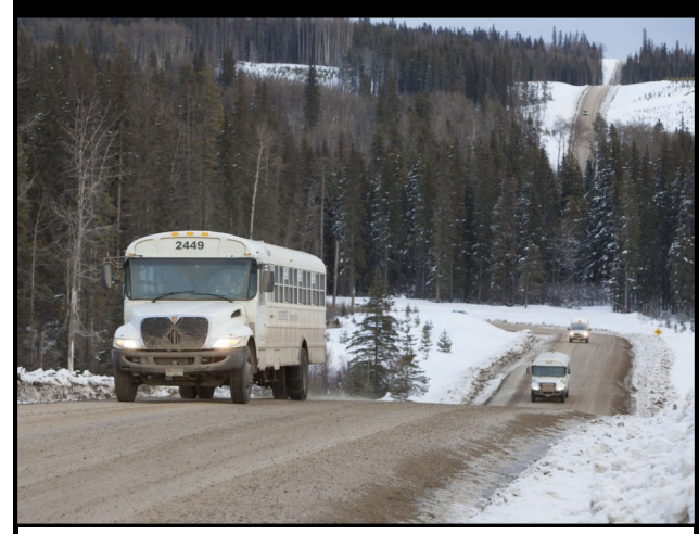
Apply the same rules of the road as you do on the highway: